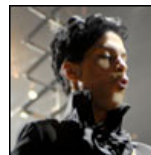
Top 10 acts for Coachella